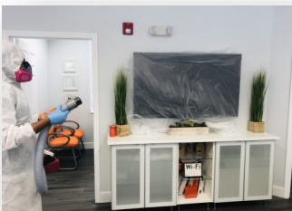
Applying EPA registered disinfectant

Long lasting anti-microbial coating applied electrostatically for complete coverage lasting up to 90 days